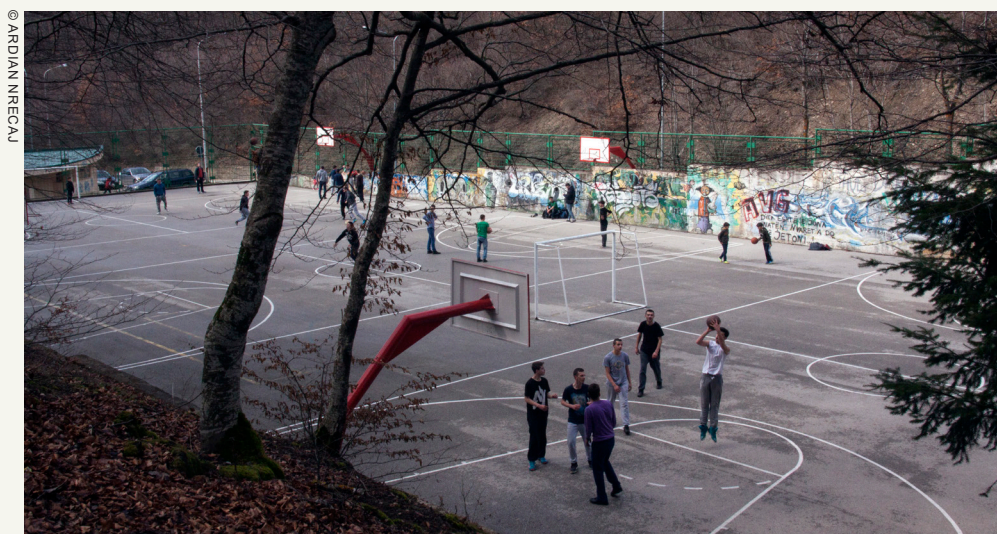
The basketball court is the most visited site in the Gërmia Park

TOURISM & RECREATION, JOBS IN PROTECTED AREA AND NATURE CONSERVATION ARE RECOGNIZED AMONG LOCALS, BUSINESSES AND GOVERNMENT AS ECONOMIC VALUES AND POTENTIALS OF GËRMIA